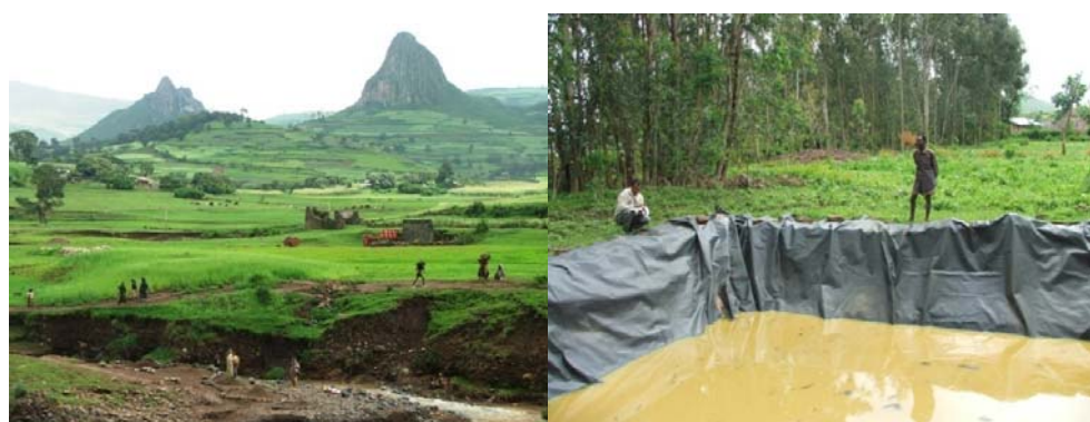
Plate 2: a) midlands in the Fogera woreda b) rainwater harvesting pond

Information obtained from Woreta Agricultural and Rural Development Bureau indicated that over the past five years (2005-2009) there has been wider use of irrigation in Fogera Woreda which also increased productivity (Fig 2). At times farmers consider local market demands and act accordingly by changing the cropping type. The increased cost of onion and potato in year 2007, for example, caused local farmers to shift from rice and millet to onion and potato in year 2008 and resulted in increased productivity per hectare (Fig 2).